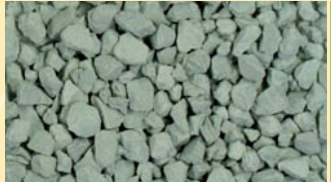
Kupzit® (2 % copper citrate granulated with bentonite)